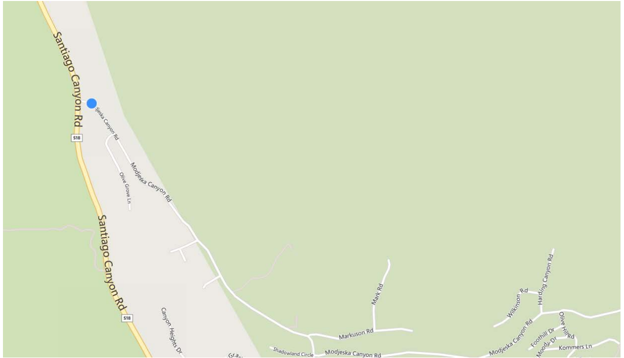
Modjeska Staging Area